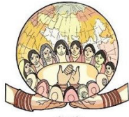
ಸುಗ್ರಮ ಗ್ರಾಮ ಪಂಚಾಯತ್ ಸಂಘಗಳ ಸಂಘಟನೆ - ಕರ್ನಾಟಕ